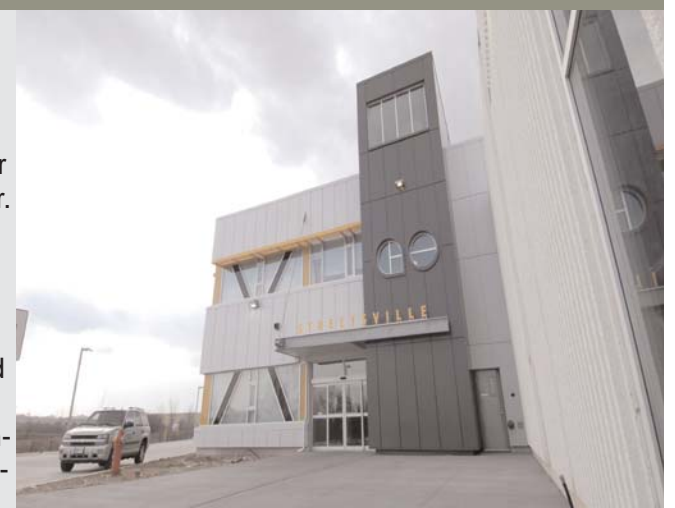
Pictured above is GO Transit's new LEED-certified bus facility located in north Streetsville.

The GO bus facility was funded by Federal and Provincial infrastructure funding to stimulate economic growth, create jobs and improve transit infrastructure. Over 400 GO Transit employees now work at this facility.