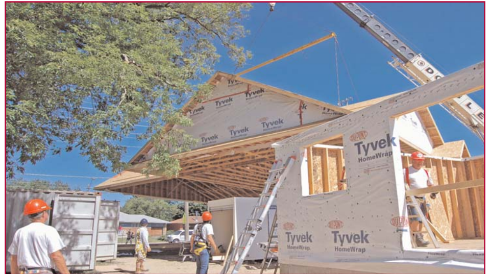
Volunteers watch as the roof is raised on Habitat for Humanity Mississauga's first build located at Britannia Road West and Earl Street.

Habitat for Humanity is the largest not-for-profit home builder in the world and has built more than 200,000 homes in 100 nations. The Mississauga chapter was formed in 2005, and its mission is to ensure that every person in Mississauga has a place live. For more information, please visit www.habitatmississauga.ca .