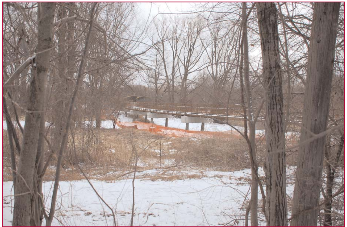
The Culham Trail will extend from Creditview Road, at Old Creditview Road, to the Davidson Trail, at Second Line West and Derry Road West to connect the sections of the trail between the Credit Valley Conservation Authority (CVC) lands and Meadowvale Conservation Park.