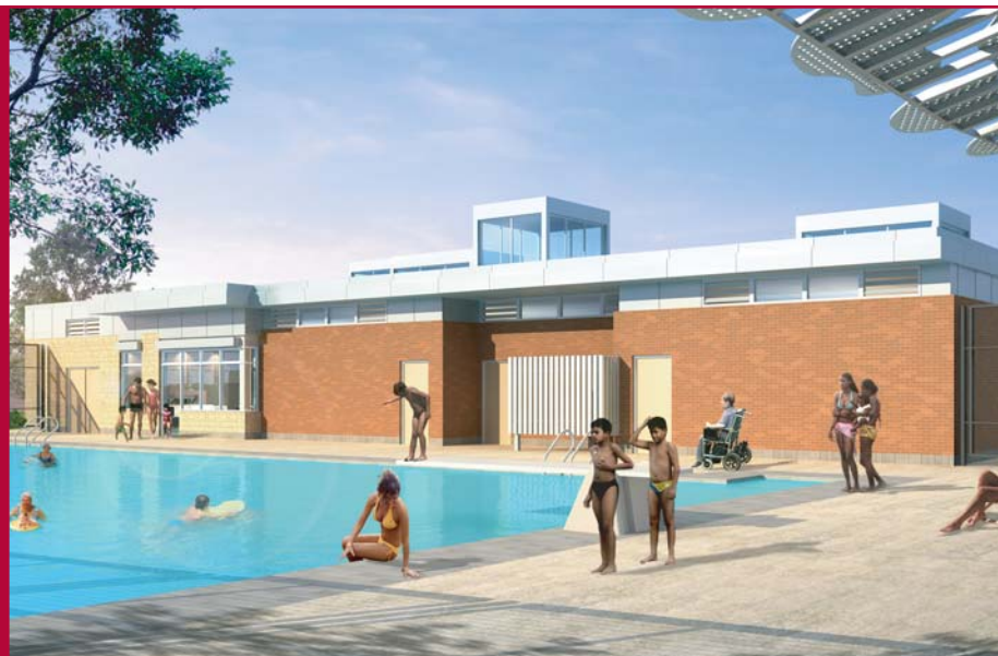
Re-development of the Streetsville Pool will include building replacement and pool tank repairs. Pictured above is the architect's rendering of the renovated exterior.

Other amenities that will be provided at the pool include a barrier-free family change room with on-deck showers, male and female change rooms, a shaded area for patrons, a sheltered outdoor learning space and landscaped areas around the facility. Construction will begin April 2010 and be completed March 2011. The pool will re-open in summer 2011.