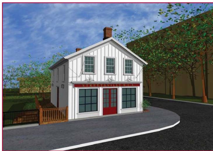
The Village Hall will undergo both exterior and interior building renovations this year. Pictured above and below are the architect's renderings of the renovated exterior and interior of the building.